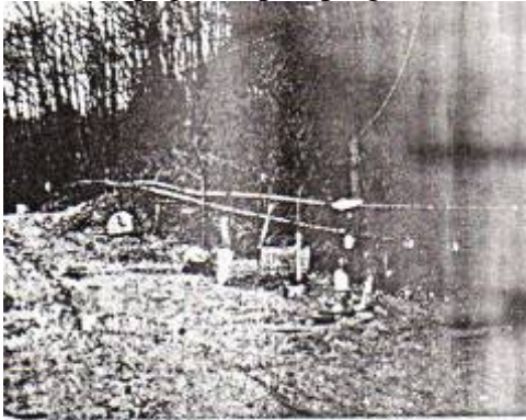
PART OF NETWORK OF PUMPS AND DRAIN PIPES

A network of plastic pipe takes water from the twelve pumps, plus several sump pumps and streams away from the slide area. So much water is present that one well is practically an artesian, water coming up the casing even when the pump is not working.