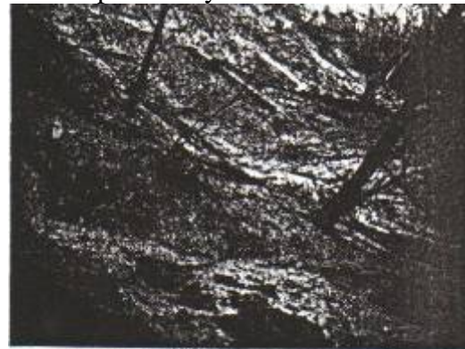
TREES, MUD SLIP TOWARD EDGE OF ROCK CLIFF

According to Supt. Andy Miller the slide is following a pattern predicted by soil experts called in the first signs of trouble. Their theory is that the slide will eventually bench itself into inactivity but will continue to ooze mud and water. Pumps will be kept in operation on a permanent basis until conditions prove they are not needed.